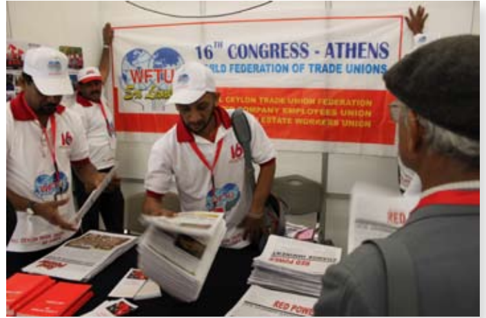
The Sri Lanka Pavillion in the pavilion facility of the Congress

An exhibition of the posters launched by WFTU over the