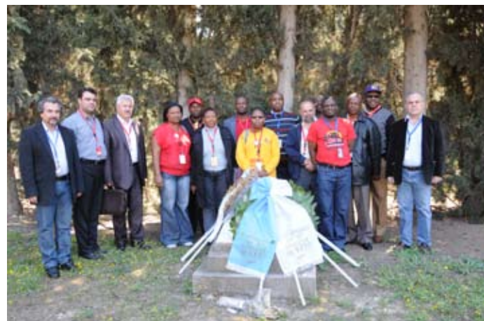
Ceremony at Kesariani Shooting Range