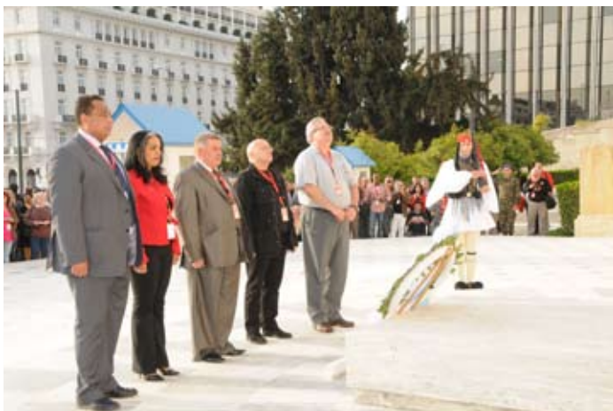
Ceremony at the Tomb of the Unknown Soldier