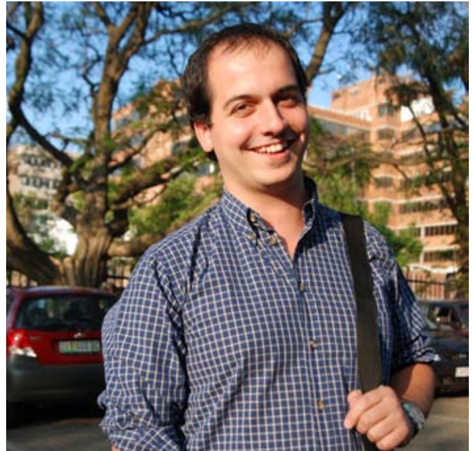
Tiago Viera, General Secretary of the World Federation of Democratic Youth (WFDY)

The majority of trade unions in CGT and CES as well supported the Lisbon Treaty which aims to put back the Confederation without a referendum. Therefore, nowadays we are in a great concern. We, the majority in CGT, are against the values of the ETUC, against the values of ITUC and against the direction that back all these moves without discussing and consulting, claiming that ETUC and ITUC's policy is modernism.”