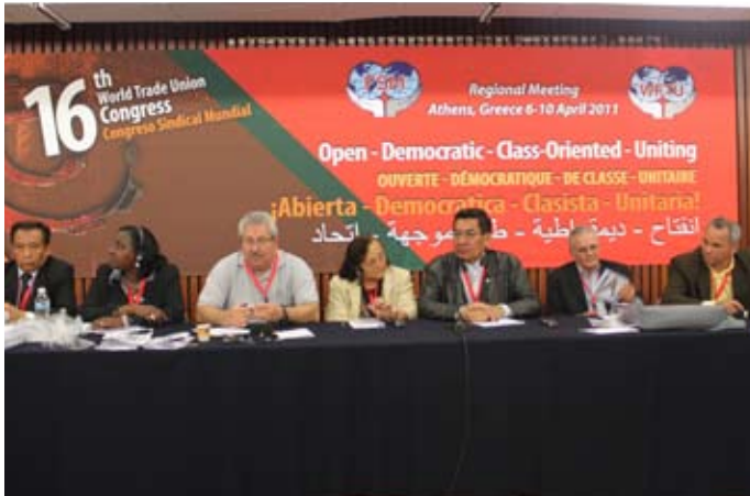
Meeting of the Regional Office of Latin America