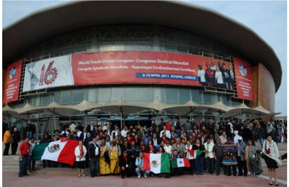
Photo of delegations outside the Stadium

Workers from every corner of the capital of Greece, holding high up the flags of international solidarity, under the sounds of working class militant songs and crowd thunders of banners and mottos, directed a warm welcome to the trade unionists that arrived in Athens after traveling miles and miles in order to participate in the 16 th World Trade Union Congress.