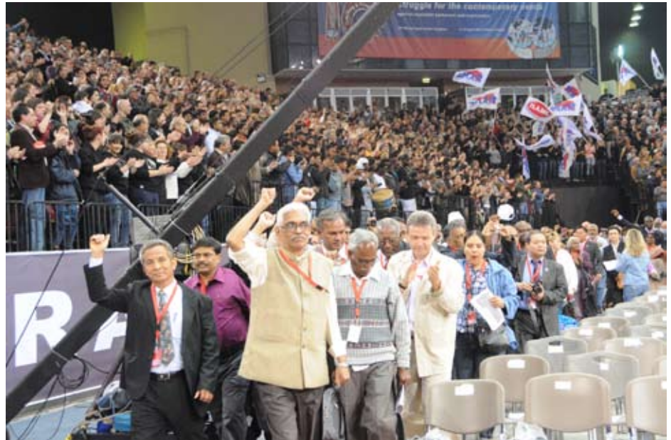
The delegations are entering the Stadium under the warm applause of the Greek people

"We shall produce an open, class oriented, democratic congress, all together workers, men and women, fighters from all the branches, all of us who have voluntarily joined the rows of the class struggle against capital and imperialism". "We go on the path of class struggle. Against imperialism and capital. For a world without man by man exploitation. For a future that shall belong to the working people". The great participation, the thousands of pages - of proposals that have been sent to the congress, as well as the thousands of Greek workers who suffused the stadium in order to participate to the initiation ceremony, constitute a thunderous proof that WFTU is strong, is in action, grows stronger day by day, and signifies the workers' interests."