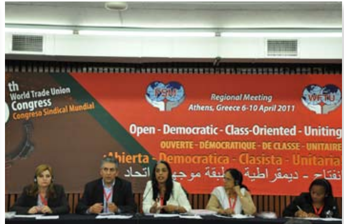
Meeting for the Women's Committee