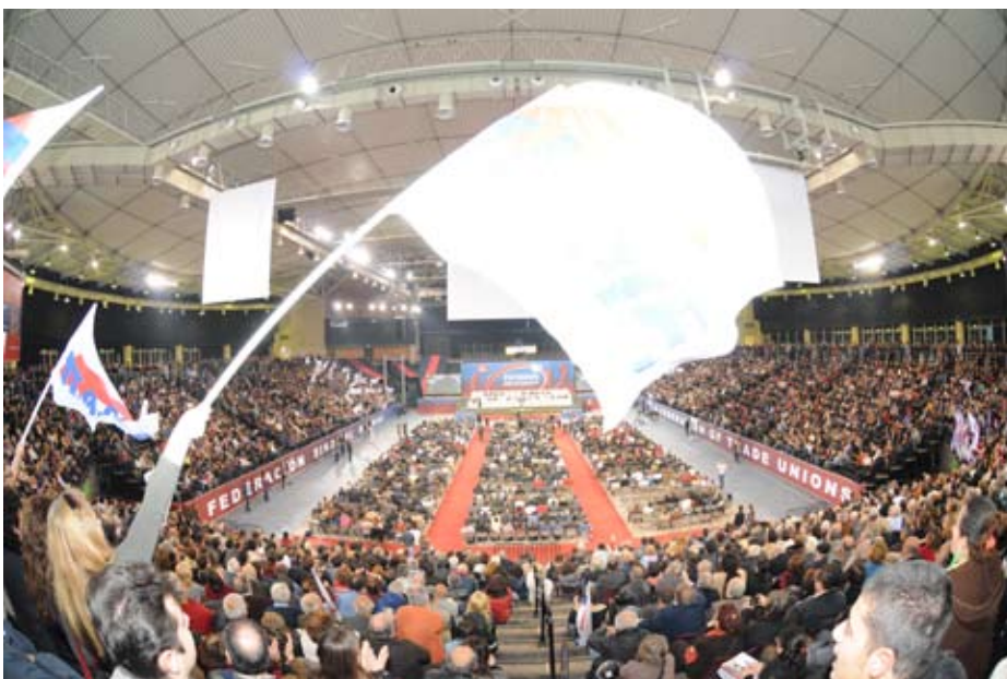
The Greek Working Class welcome the 16 th Congress

The official initiation of the congress was declared by the President of