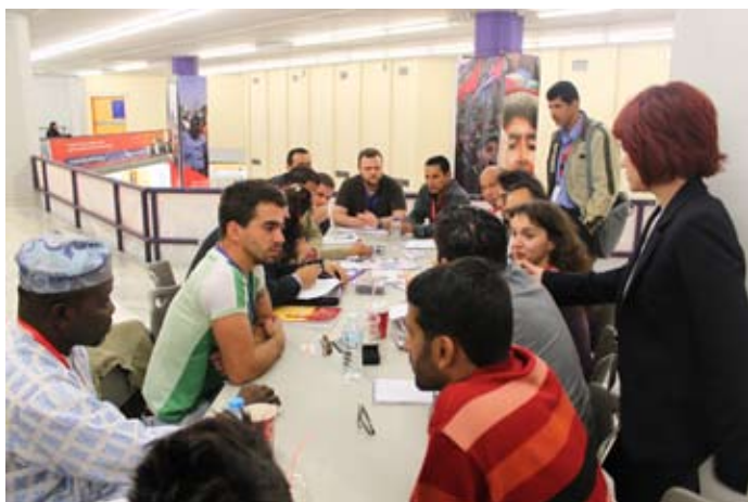
Meeting of the International Youth Committee of WFTU