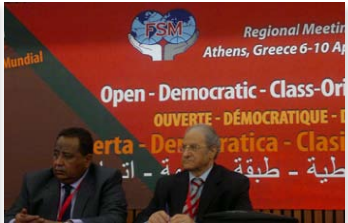
Meeting of the Regional Office of Middle East

The European conventioners, from the social-democratic Sweden with its notorious "model" to the bisected Cyprus, all of them referred to the capitalist reformation in their countries (privatizations, cutting offs from wages and pensions, layoffs, unemployment, abolitions of collective agreements), to the advancing capitalist crisis and to the