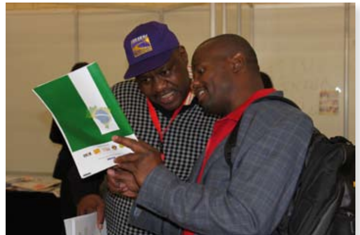
Exchange of experience: important aspect of the Congress