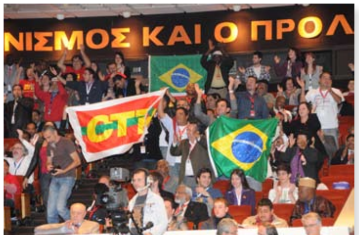
Internationalist Event organized by the CP of Greece