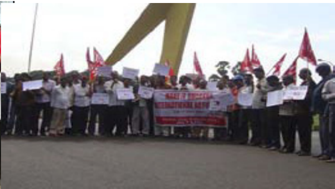
Demonstration in Visakhapatnam