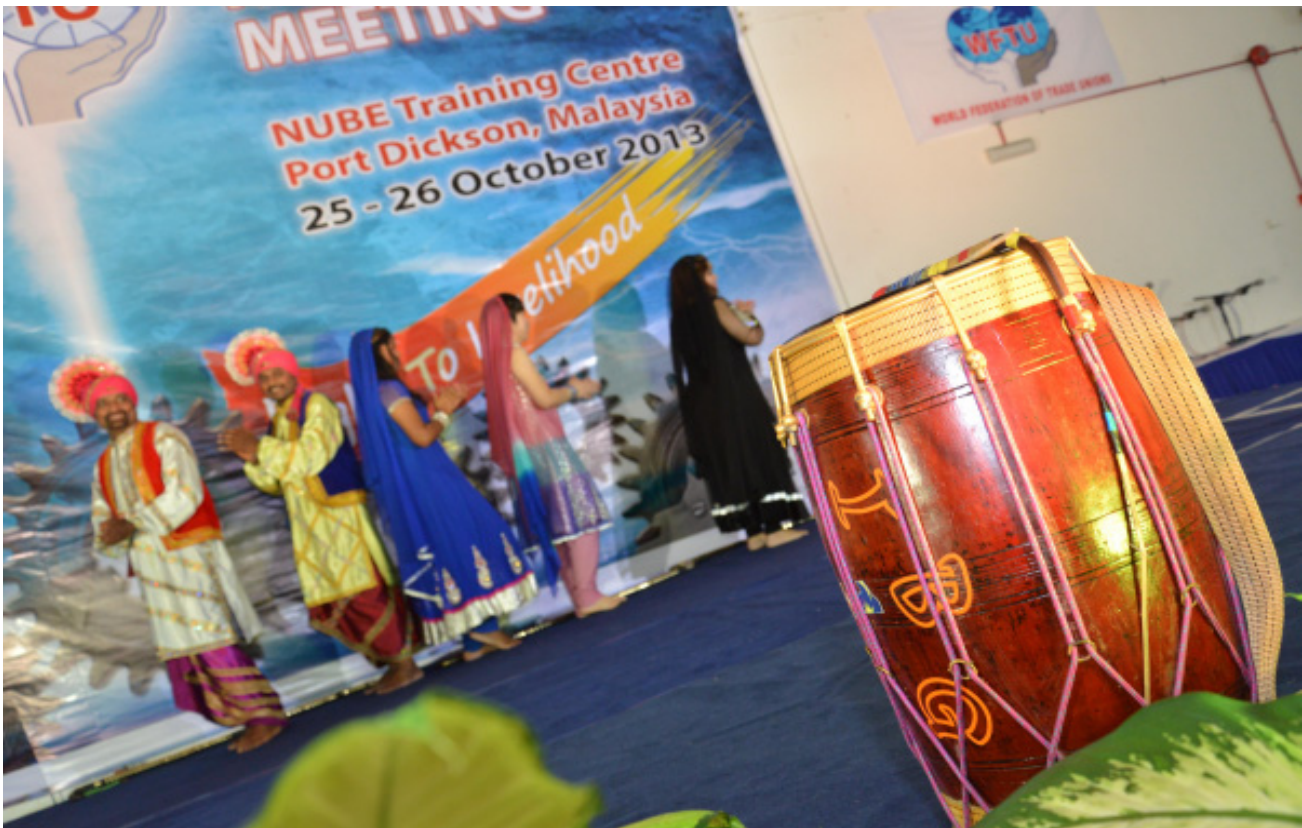
A scene from the cultural programme