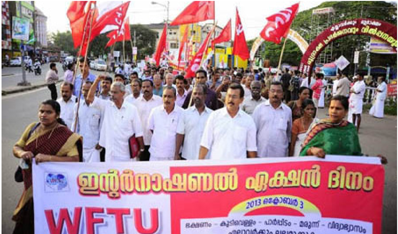
Rally in Kerala