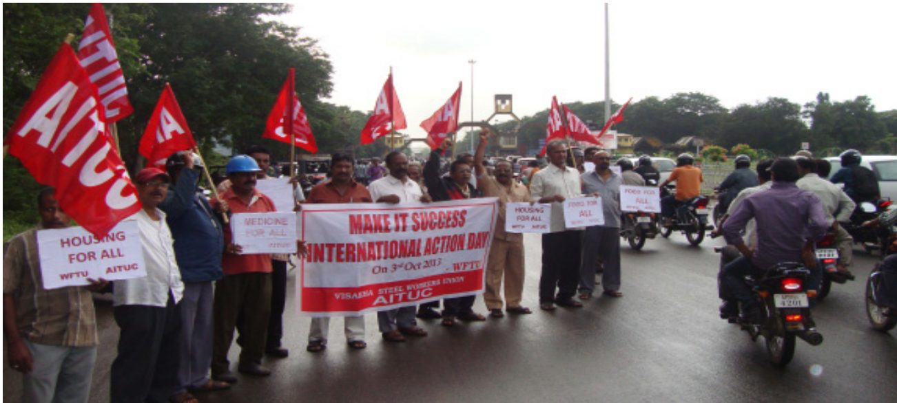
Demonstration in Visakhapatnam