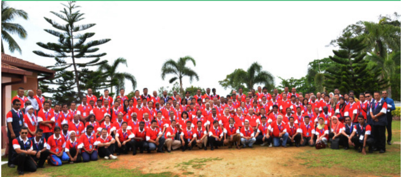
Participants in the Asia-Pacific Regional meeting held in Port Dickson (Malaysia) on 25 th & 26 th October 2013