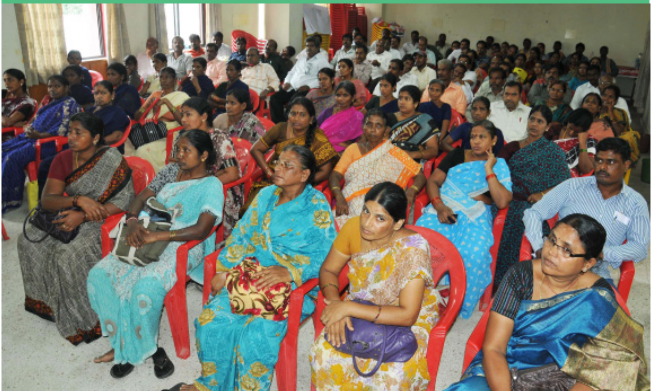
A view of the participants