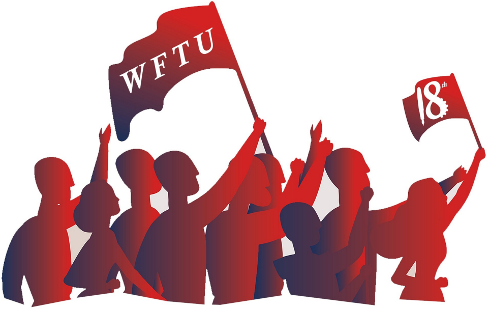
World Trade Union Congress Rome, Italy 6-8 May 2022