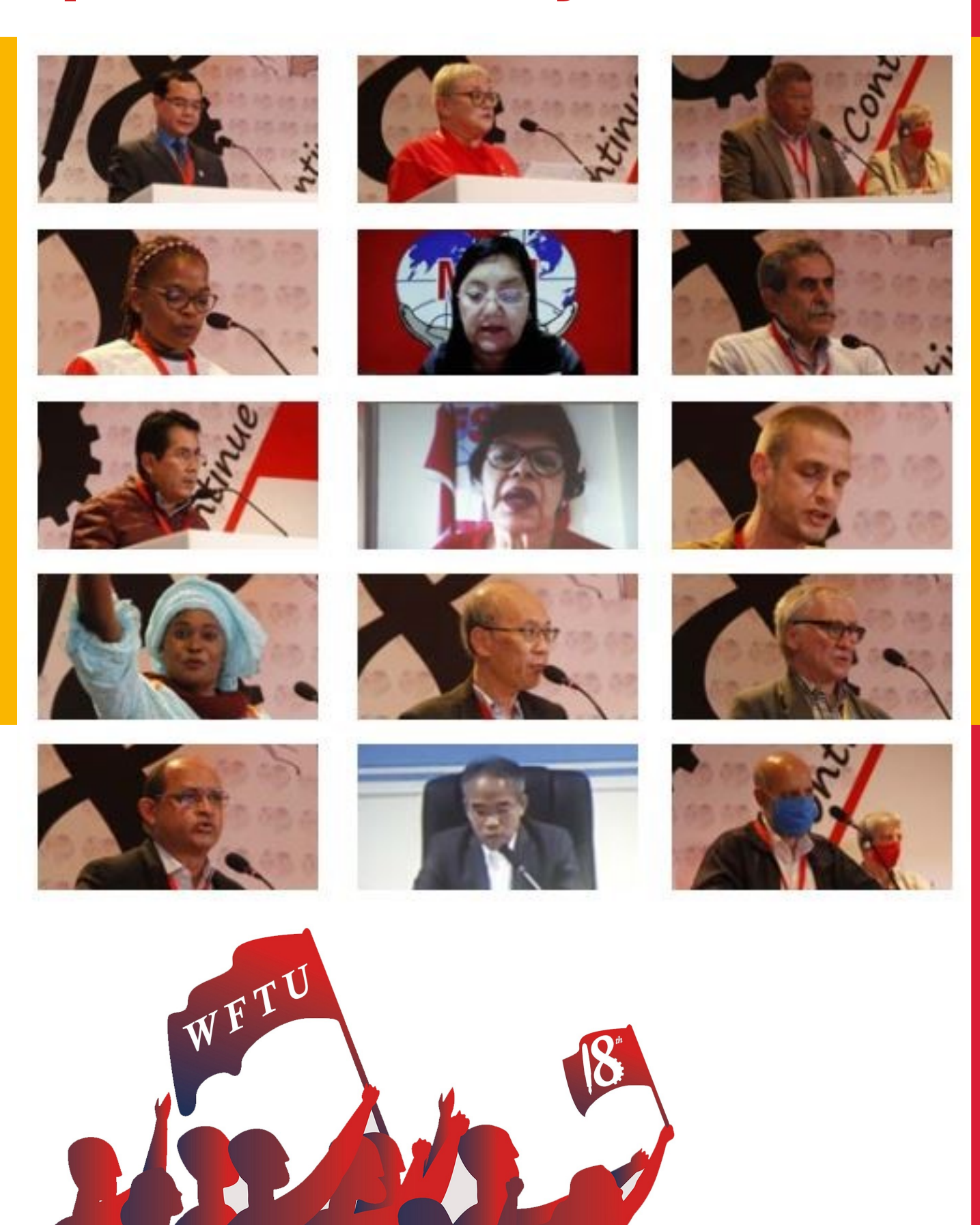
World Trade Union Congress Rome, Italy 6-8 May 2022